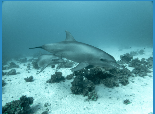
Figure 2 - Indo-Pacific bottlenose dolphin in the Northern Red Sea Islands IMMA.

The diurnal activity pattern of the Indo-Pacific bottlenose dolphins in the Northern Red Sea Islands was studied from 2012 and 2017 from vessel and/or