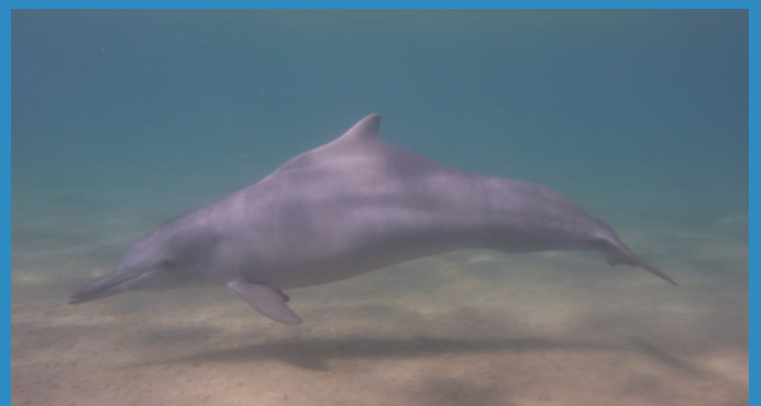
Figure 1 - Indian Ocean humpback dolphin in the Northern Red Sea Islands IMMA.

The Northern Red Sea Islands are located in the northern part of the Red Sea, adjacent to the coastal areas of El Gouna and Hurghada. The IMMA includes a complex network of islands, coral reefs, shallow bays and lagoons, seagrass beds and open waters. The area is very important for a year-round resident population of at least 200 Indo-Pacific bottlenose dolphins, Tursiops aduncus . A smaller group of Indian Ocean humpback dolphins, Sousa plumbea , regularly encountered in the coastal waters and around the coastal reefs. The Indo-Pacific bottlenose dolphins feed in the open waters among islands and reefs and rest, mate, socialize and nurse their calves in proximity to several reefs in the IMMA, in particular Shaab El Fanous, Shaab El Erg, Shaab Abu Nugar and around Gubal island. The dolphins are increasingly subjected to intense swimming-with-the-dolphin tourist activities that are considered to be detrimental to the conservation of these animals.