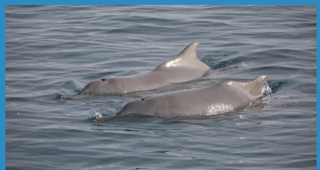
Figure 3 - Indian Ocean humpback dolphin pair.

SIF. 2016. Aldabra Atoll Management Plan . Seychelles Islands Foundation (SIF) , 1–98. Available at: https://www.sif.sc/sites/default/files/downloads/Aldabra%20Atoll%20Management%20Plan.pdf . (Accessed: 1 February 2019).