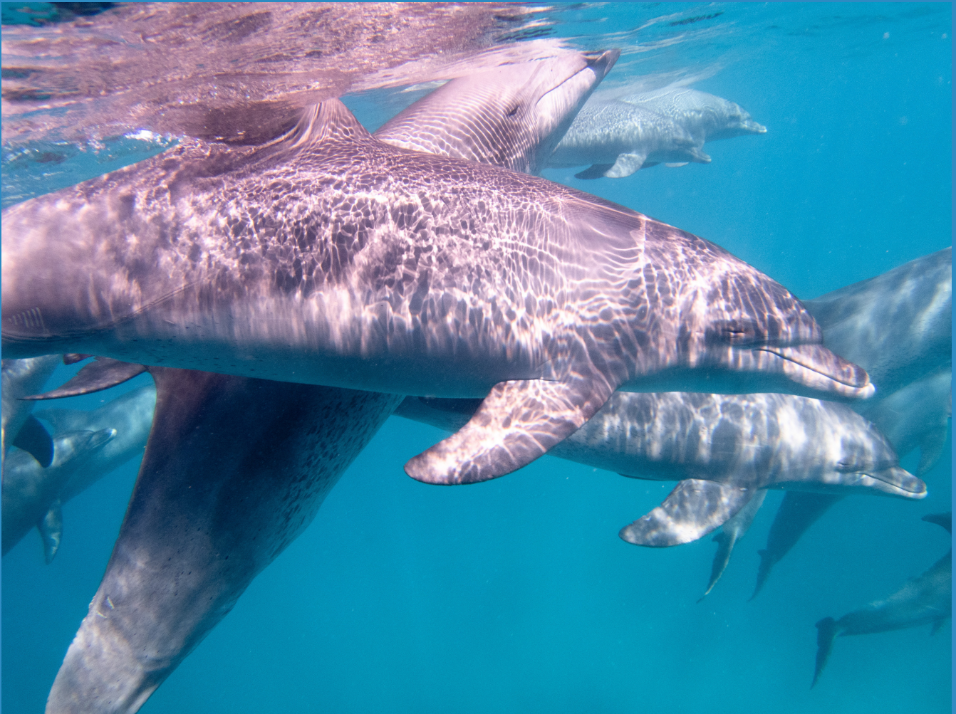
Figure 5 - Indo-pacific bottlenose dolphins in the Northern Red Sea Islands IMMA.

PDF made available for download at: https://www.marinemammalhabitat.org/wp-content/uploads/imma-factsheets/WesternIndianOcean/Northern-Red-Sea-Islands-WesternIndianOcean.pdf